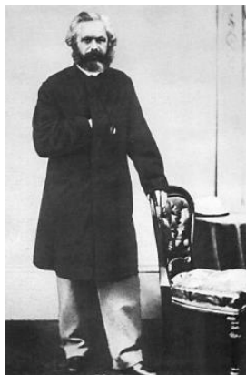
Karl Marx Meets Barack Hussein Obama

Source: http://iowntheworld.com/blog/?p=147930