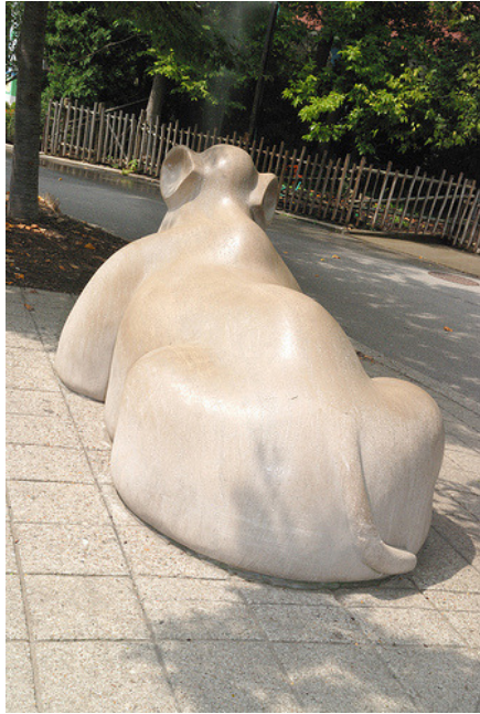
JT: Nature does repeat itself!