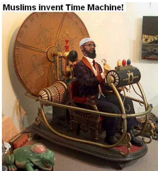
Muslims invent Time Machine!