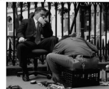
There would be no wealth inequality anymore, and the class system would be abolished.