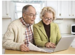
Seniors would retire comfortably in dignity and respect.