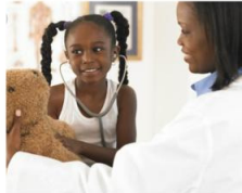
Everyone would receive free, comprehensive, universal healthcare.