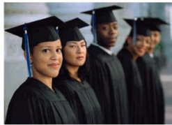
Everyone would be entitled to a quality education, without cost.