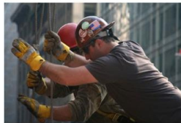
Workers Rights would be fully protected, and they would receive the full value of their labor.