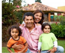
Housing would be affordable, safe, and available for everyone.