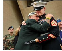
Veterans would receive the treatment they deserve for the sacrifices they made for this country.