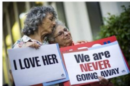
Everyone would have equal rights and freedoms regardless their orientation.