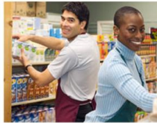
There would be equal pay and benefits for men and women.