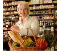
Food would be healthy, fresh, and freely available.