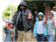
Everyone would receive equal protection under the law, and an end to racism and racial profiling.