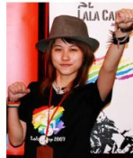
Women would have full reproductive rights upheld by law.