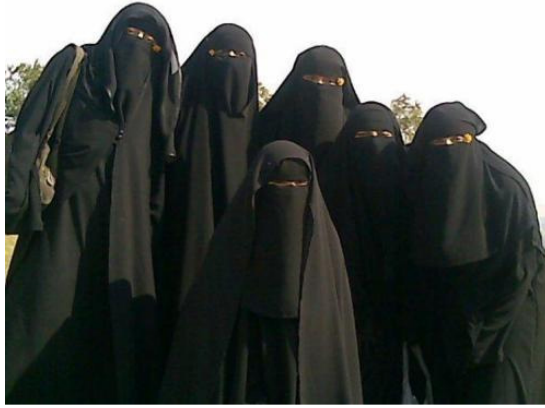
Muslim women wearing the naqab.