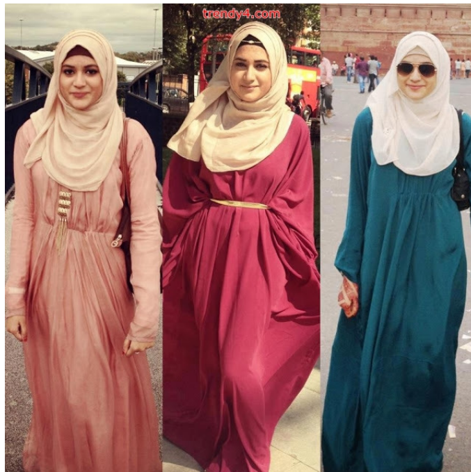
Three young Muslim girls/women wearing the Hijab.

Muslims will demand segregation from non-Muslims by establishing No-Go Areas for non-Muslims, or even a Sharia police that will make sure Muslims obey the Koran, Muhammad, and the Sunnah.