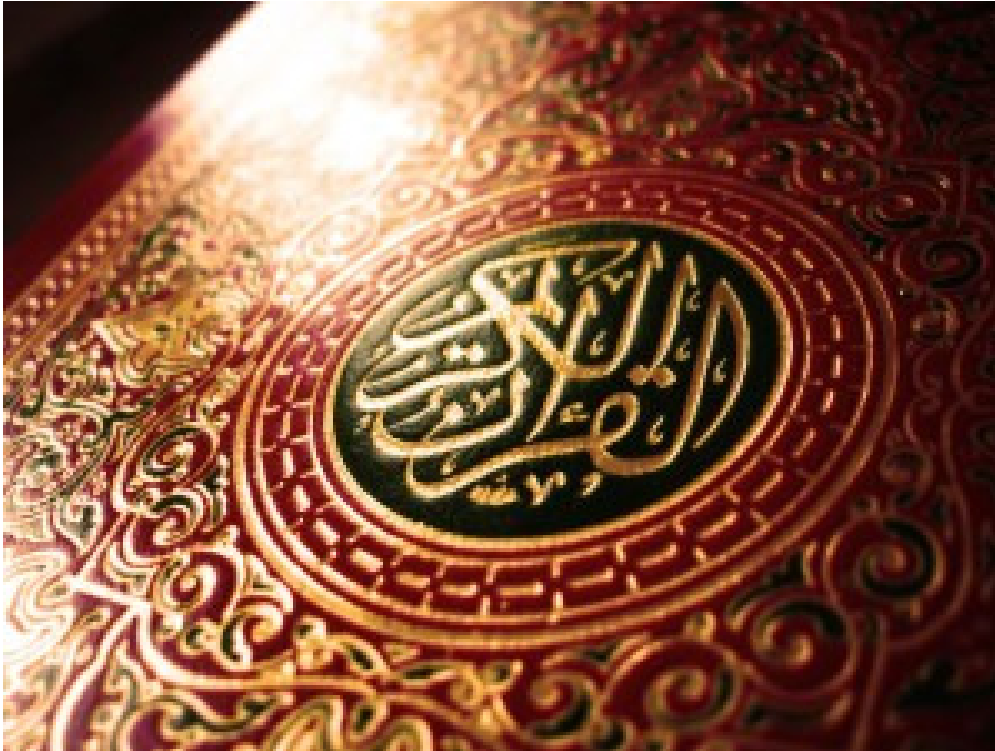
Qur'an Cover

In Bangladesh in 2011, a 14 year-old girl, who was sexually assaulted by her 40 year-old cousin, received 100 lashes for her “adulterous” behavior . She did not survive her punishment for being a victim. Over the past decade, several hundred women have been flogged in Bangladesh under similar circumstances.